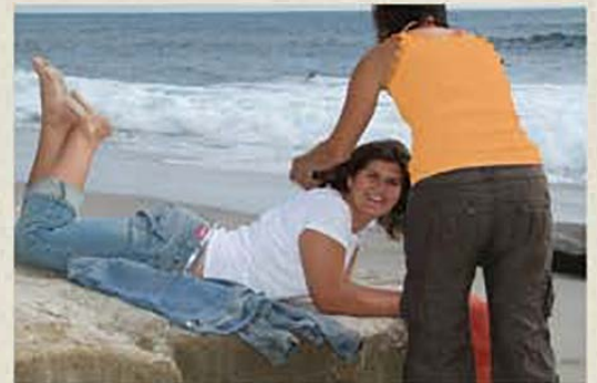
Each Photography team has a Personal Stylist to help you look your best.

Girls, please avoid mini skirts for they are too confining to pose. Also if you would like to wear a dress, we suggest avoiding empire waist or "baby-doll" styles. Unpredictable winds cause this style dress to make one look heavier than desired.