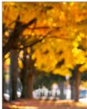
DCP - Fall