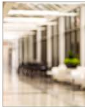
DCP - Interior 1