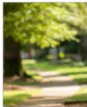
DCP - Spring