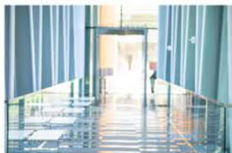
DCP - Interior 2